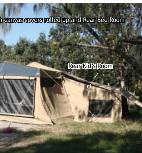
Canvas covers rolled up and Rear Bed Room