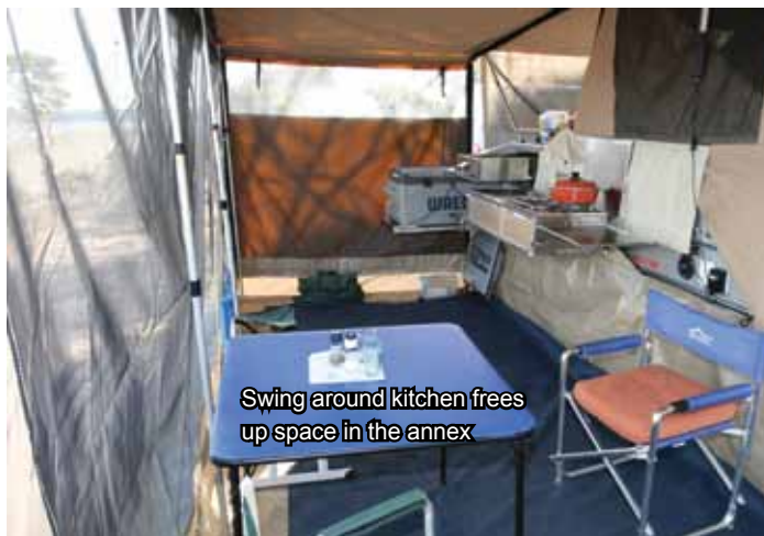
Swing around kitchen frees up space in the annex

Aussie Swag Campers has a number of annex pack options available. (Refer to the price list for details of the packs.) Screen walls with covers can be zipped to the awning roof to form a fully enclosed annex. The canvas covers can be removed, rolled up or pegged out at an angle to improve air circulation.