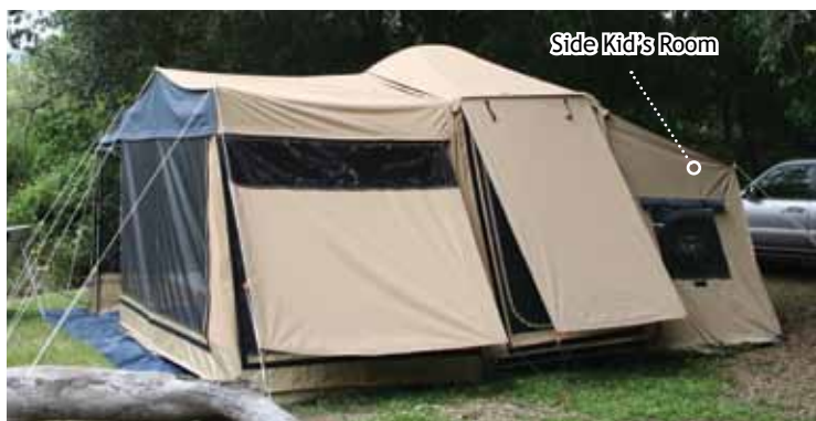
Side Kid's Room

The side Bed/Kid's Room is one whole room, 4m long x 1.6m wide. The canvas roof, canvas walls and heavy duty vinyl floor are sewn into one piece. Access is through the second doorway of the main tent and an outside screened doorway (which is double zipped) located at the front end of the camper. In addition to the two screened doors, the Kid's Room also has three large windows with solid canvas flaps on the exterior of the tent.