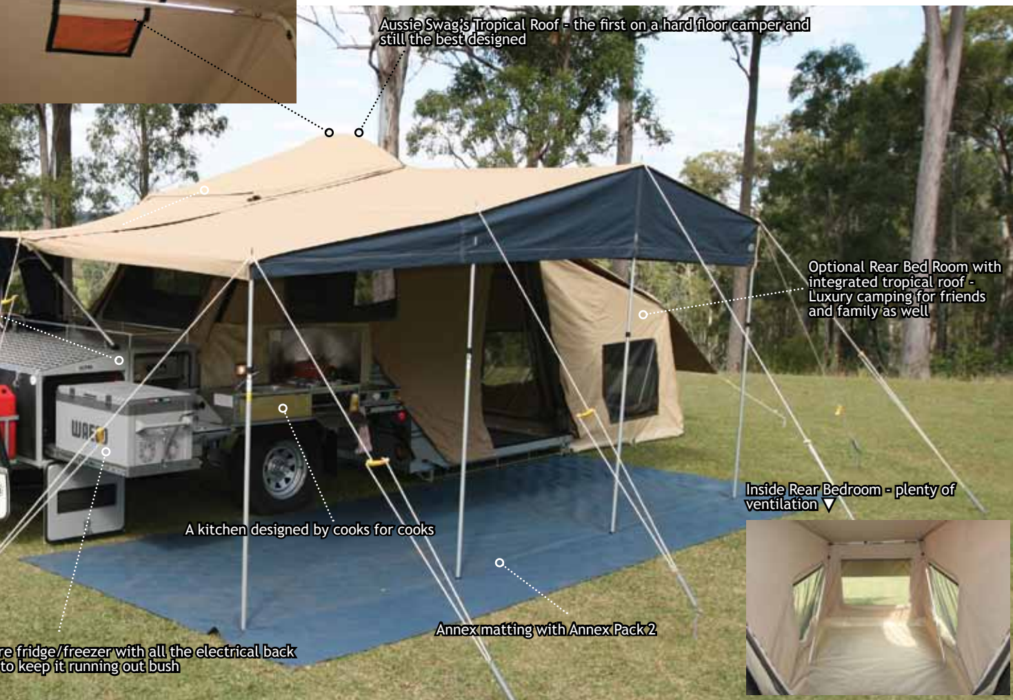
Optional Rear Bed Room with integrated tropical roof - Luxury camping for friends and family as well